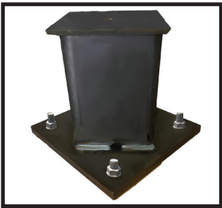
Reusable beveled cap available.